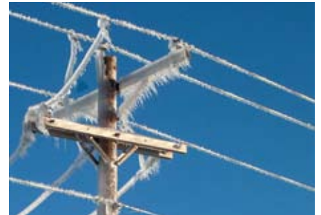
The New Years ice storm left 46,300 western Kansas residents without power and 10,900 poles down. Some members went without power for more than 12 days.

Currently, we are about 60% complete at an expenditure near $3 million. Projections call for completing the work by mid 2008.