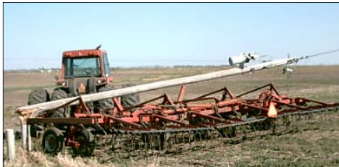
A primary line carrying 7,200 volts of electricity fell on this tractor when the driver came too close to the electrical pole.

Imagine that you are driving a tractor to the field through a back gate when things come to a screeching halt. You look back to see what's stopping