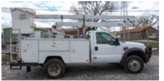
Submit your bid for the F550 above by May 29, 2020.

Deliver bid to above address, or mail to PO Box 308, Cedar Vale, KS 67024-0308.